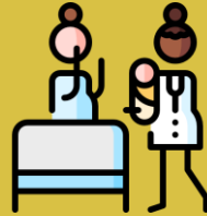
New born & mother care